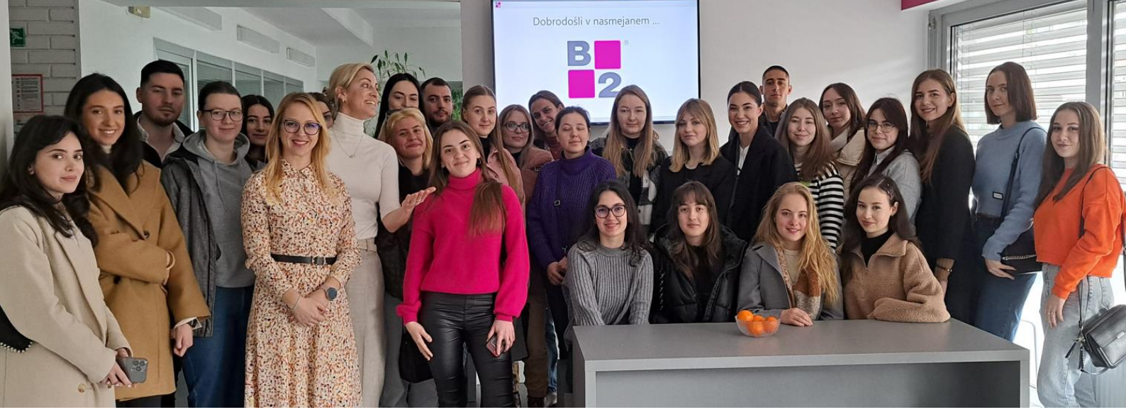
Erasmus Spring generation 2023.